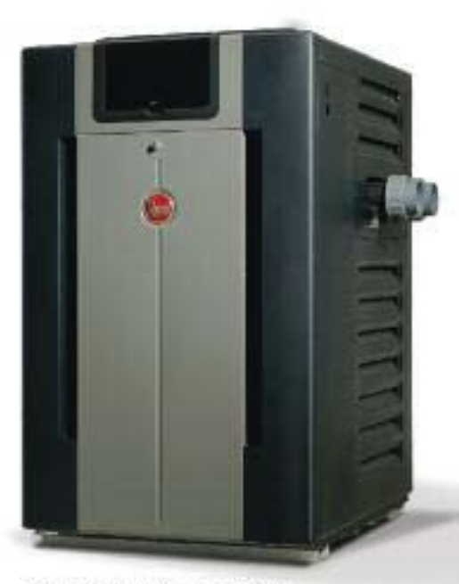
PHEEM DIGITAL POOL & SPA HEATER